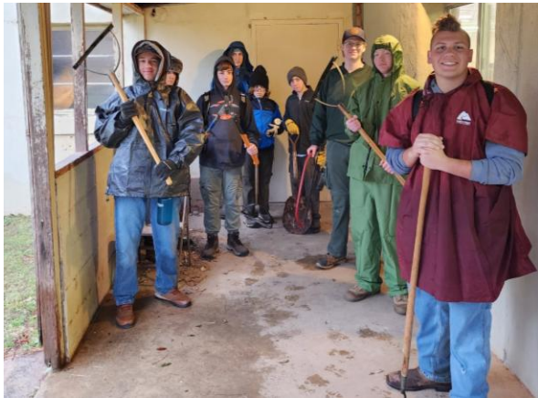
(Ordeal Candidates and their Elangomat before starting workday)

Our Spring Fellowship this year had a great turnout, and we inducted several new Ordeal members. It was held at Williams Scout Reservation, where the lodge did service work for 6 out of the 12 campsites. Even though it was raining for most of the morning, everyone still had a great time.